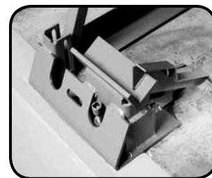
Front SafeTFrame™ Pedestal