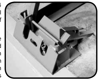
Front SafeTFrame™ Pedestal