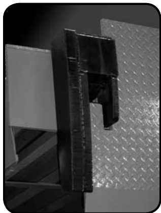
Integrated Steel Faced Bumpers