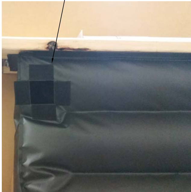
HEAD BAG AIR TUBE ATTACHMENT FLAPS CONNECT TO SIDE BAG ATTACHMENT FLAPS

9) CONNECT SIDE BAG AIR TUBE ATTACHMENT FLAPS TO CONNECT TO HEAD BAG AIR TUBE ATTACHMENT FLAPS