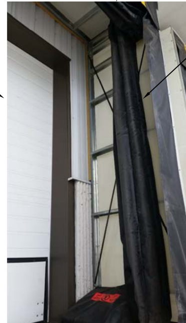
INSIDE VIEW OF RIGHT SIDE MEMBER