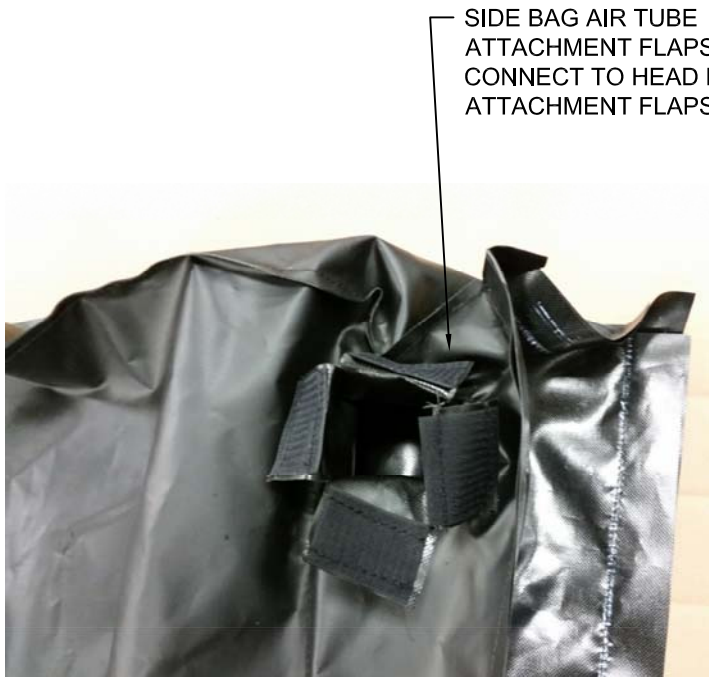
SIDE BAG AIR TUBE ATTACHMENT FLAPS CONNECT TO HEAD BAG ATTACHMENT FLAPS