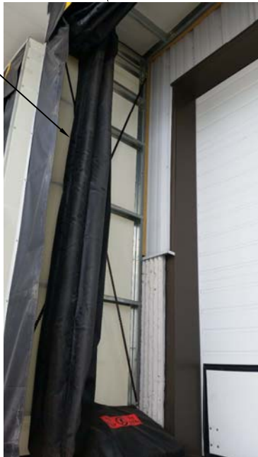
INSIDE VIEW OF LEFT SIDE MEMBER