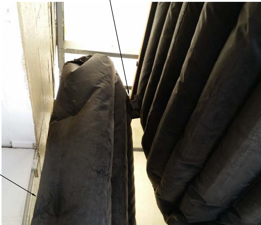
SIDE AIR BAG