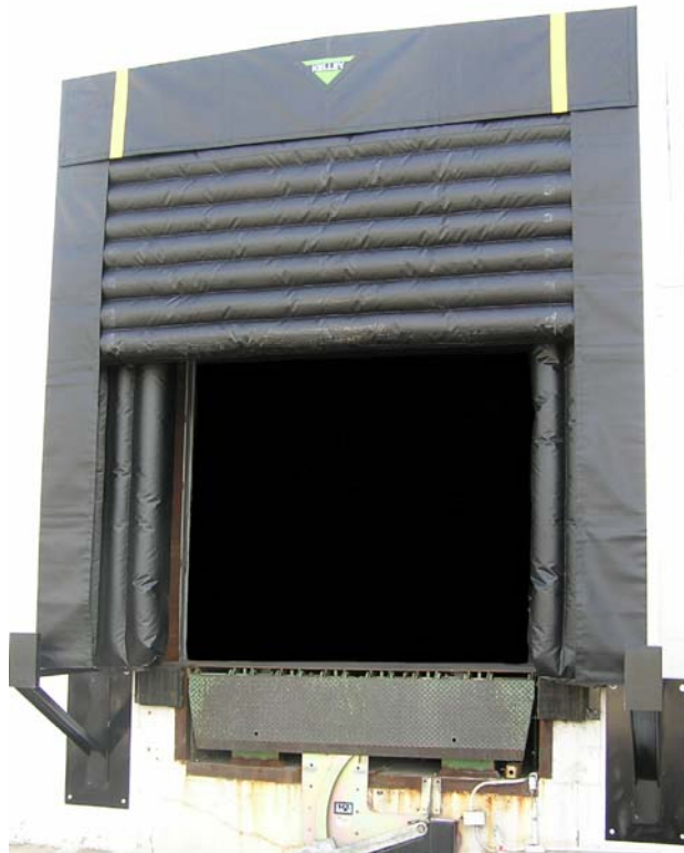
VIEW FROM OUTSIDE OF DOCK

11) TEST PRODUCT. INFLATE TO ENSURE PROPER OPERATION.