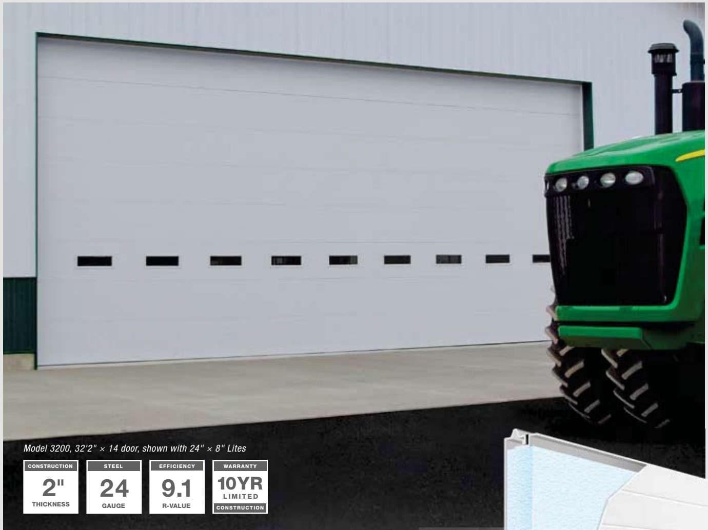
Model 3200, 32'2" x 14 door, shown with 24" x 8" Lites