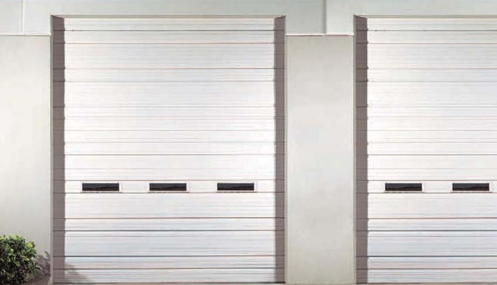
Model 524 with 24" x 6" Lites