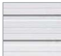
Ribbed Panel Design