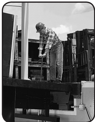
Dock worker uses push bar to activate and release